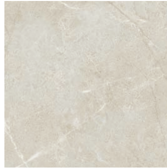
13" x 13" TORINO AVORIO HD PORCELAIN TILE 4500-0676-0