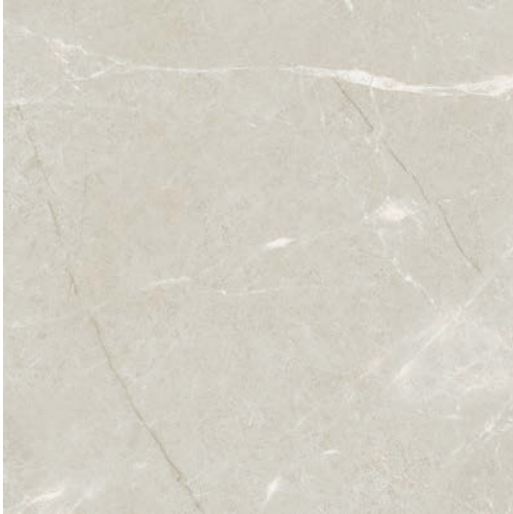
20" x 20" TORINO AVORIO HD PORCELAIN TILE 4500-0727-0