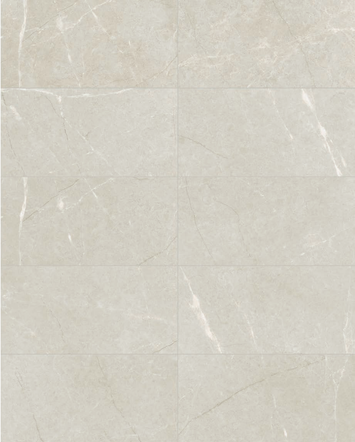
12" X 24" TORINO AVORIO HD PORCELAIN TILE