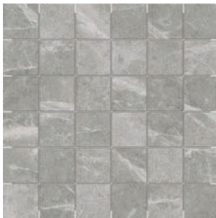
2" x 2" TORINO ARGENTO HD PORCELAIN MOSAICS 4501-0289-0