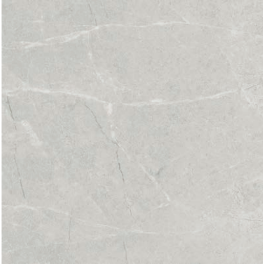
20" x 20" TORINO GRIGIO HD PORCELAIN TILE 4500-0728-0