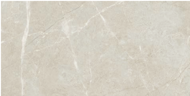
12" x 24" TORINO AVORIO HD PORCELAIN TILE 4500-0682-0