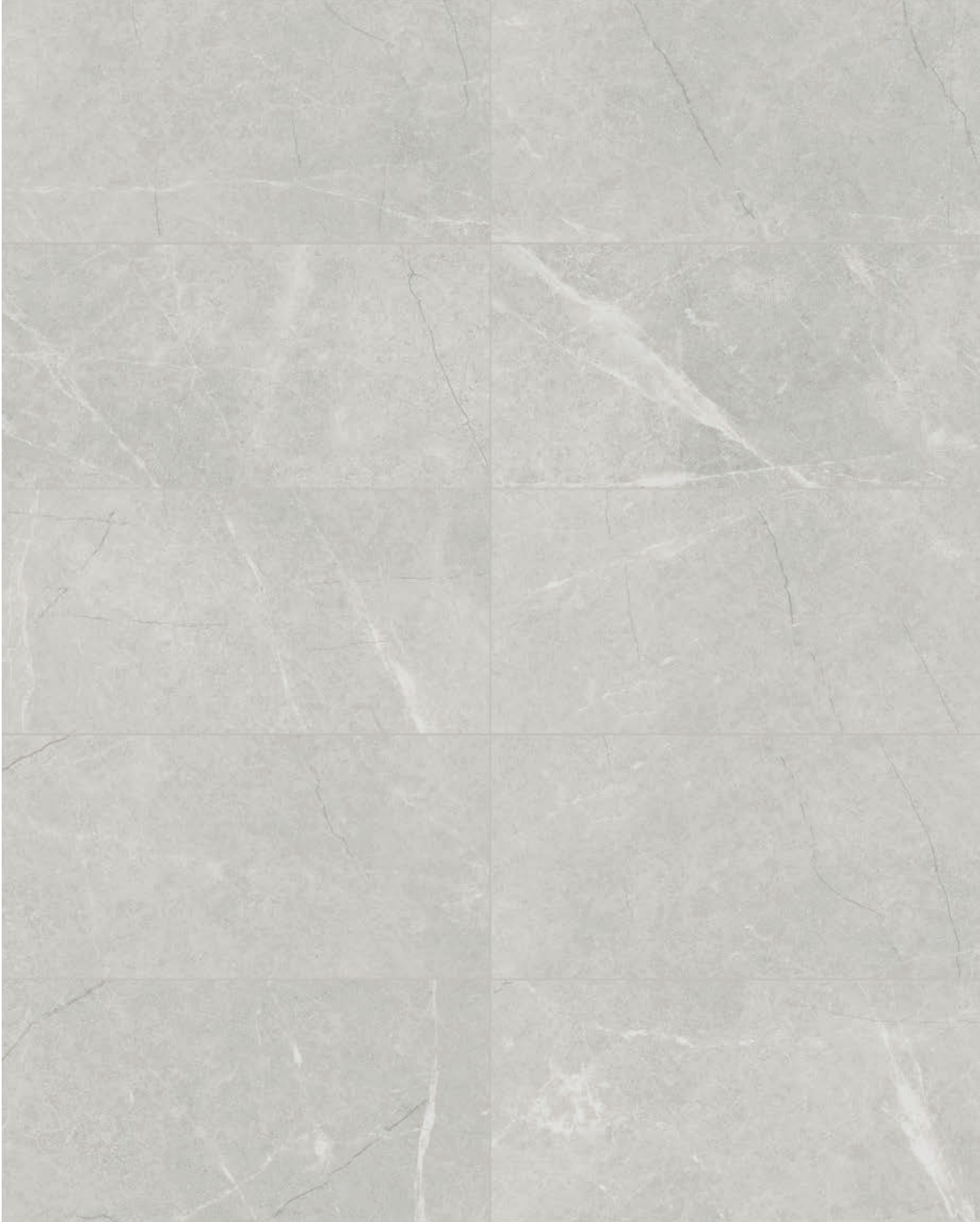
12" X 24" TORINO GRIGIO HD PORCELAIN TILE