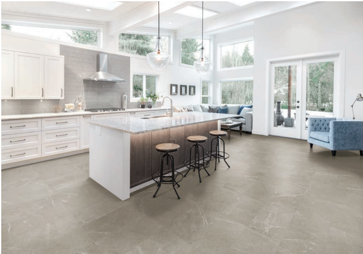
12" x 24" TORINO VANIZIO HD PORCELAIN TILE