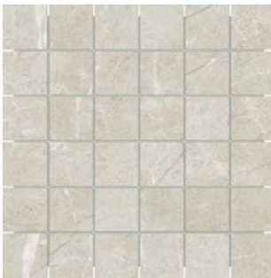
2" x 2" TORINO AVORIO HD PORCELAIN MOSAICS 4501-0290-0