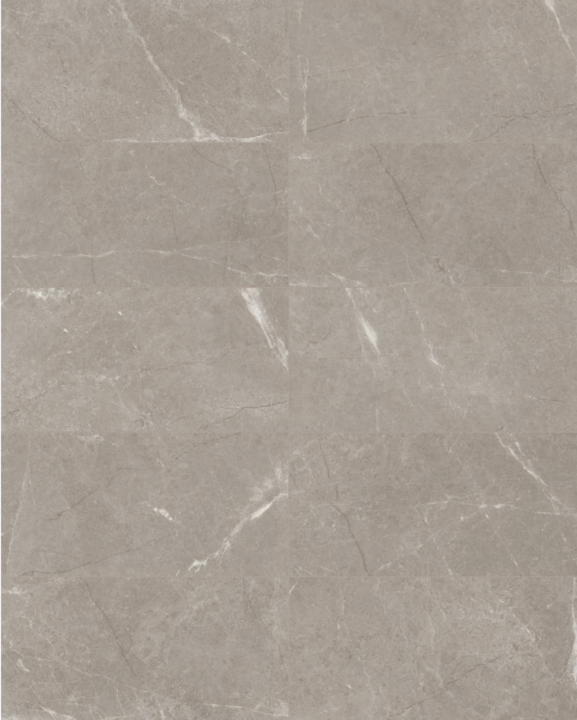
12" X 24" TORINO VANIZIO HD PORCELAIN TILE