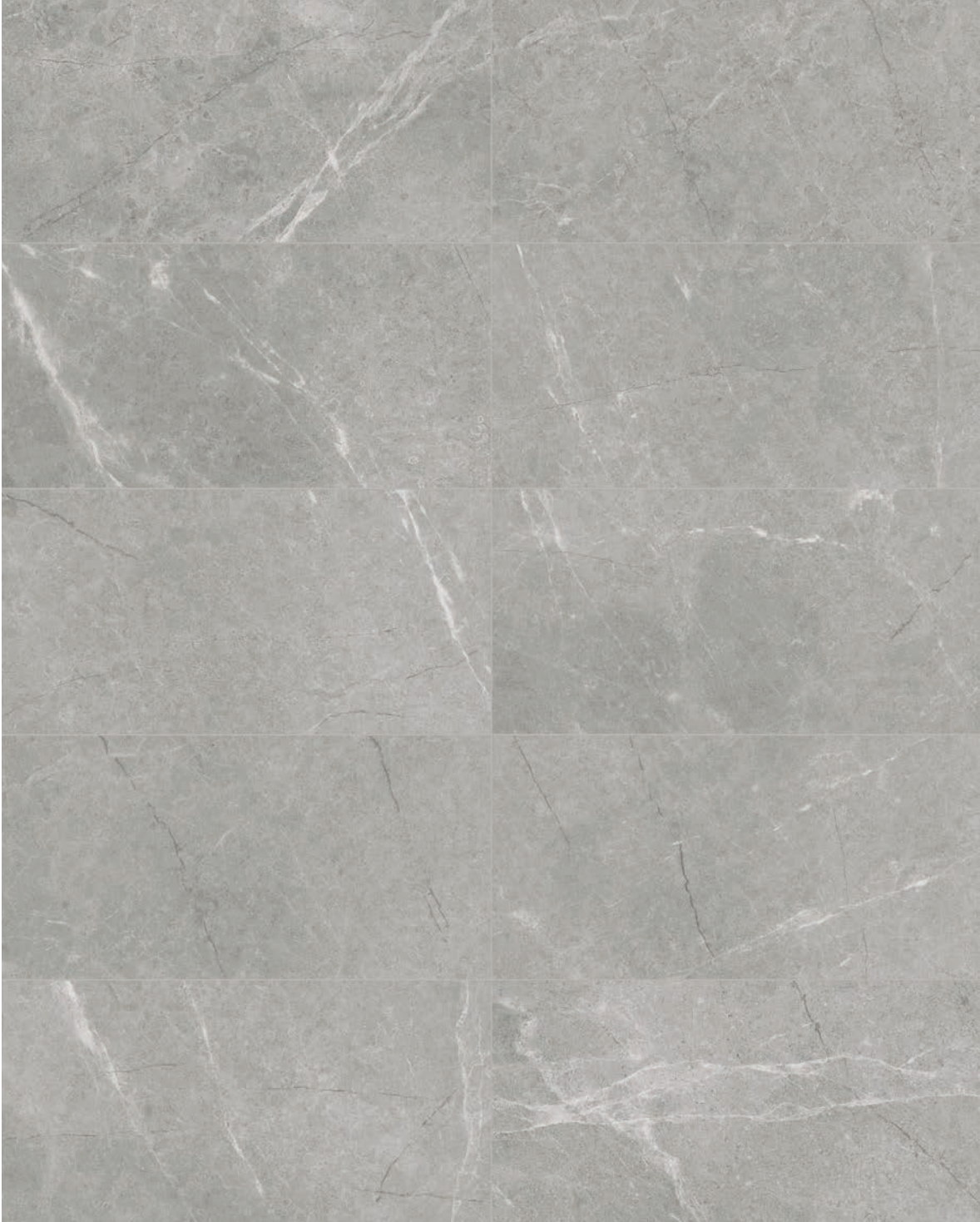
12" X 24" TORINO ARGENTO HD PORCELAIN TILE