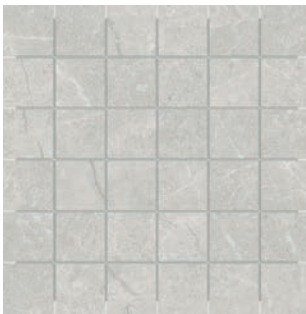
2" x 2" TORINO GRIGIO HD PORCELAIN MOSAICS 4501-0291-0