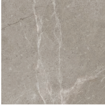
13" x 13" TORINO VANIZIO HD PORCELAIN TILE 4500-0678-0