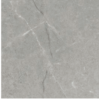
13" x 13" TORINO ARGENTO HD PORCELAIN TILE 4500-0679-0