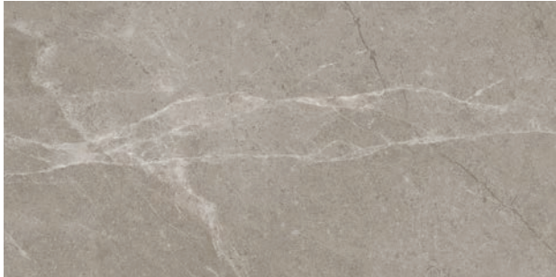
12" x 24" TORINO VANIZIO HD PORCELAIN TILE 4500-0680-0