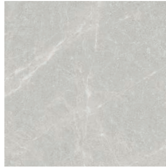
13" x 13" TORINO GRIGIO HD PORCELAIN TILE 4500-0677-0