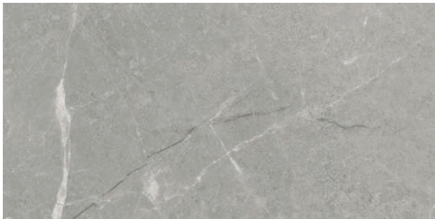
12" x 24" TORINO ARGENTO HD PORCELAIN TILE 4500-0681-0