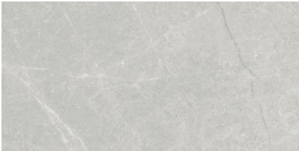
12" x 24" TORINO GRIGIO HD PORCELAIN TILE 4500-0683-0